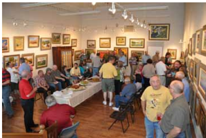
Commissioners enjoy a reception at the L. Martin Pavletich Art Gallery in Cimarron, New Mexico.