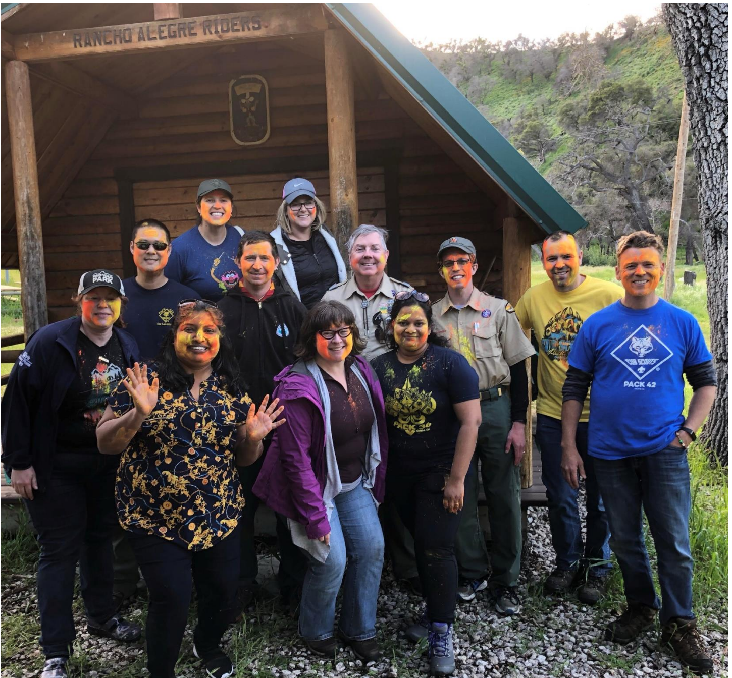
The Festival of Color was celebrated 3 days after the spring equinox.