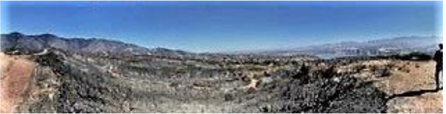
The view from Rancho Alegre on July, 2017.

What a difference 20 months makes! [contributed by Carlos Cortez]