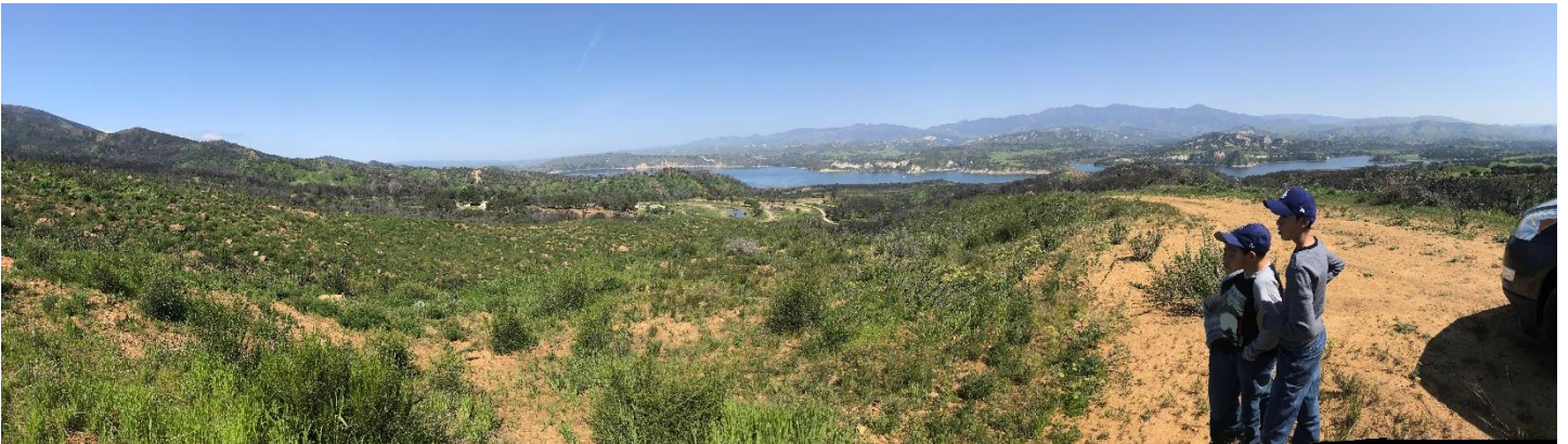
A similar view from Rancho Alegre on 24 March 2019.