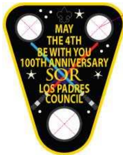
Booth Participant Patch (Tie Slide)